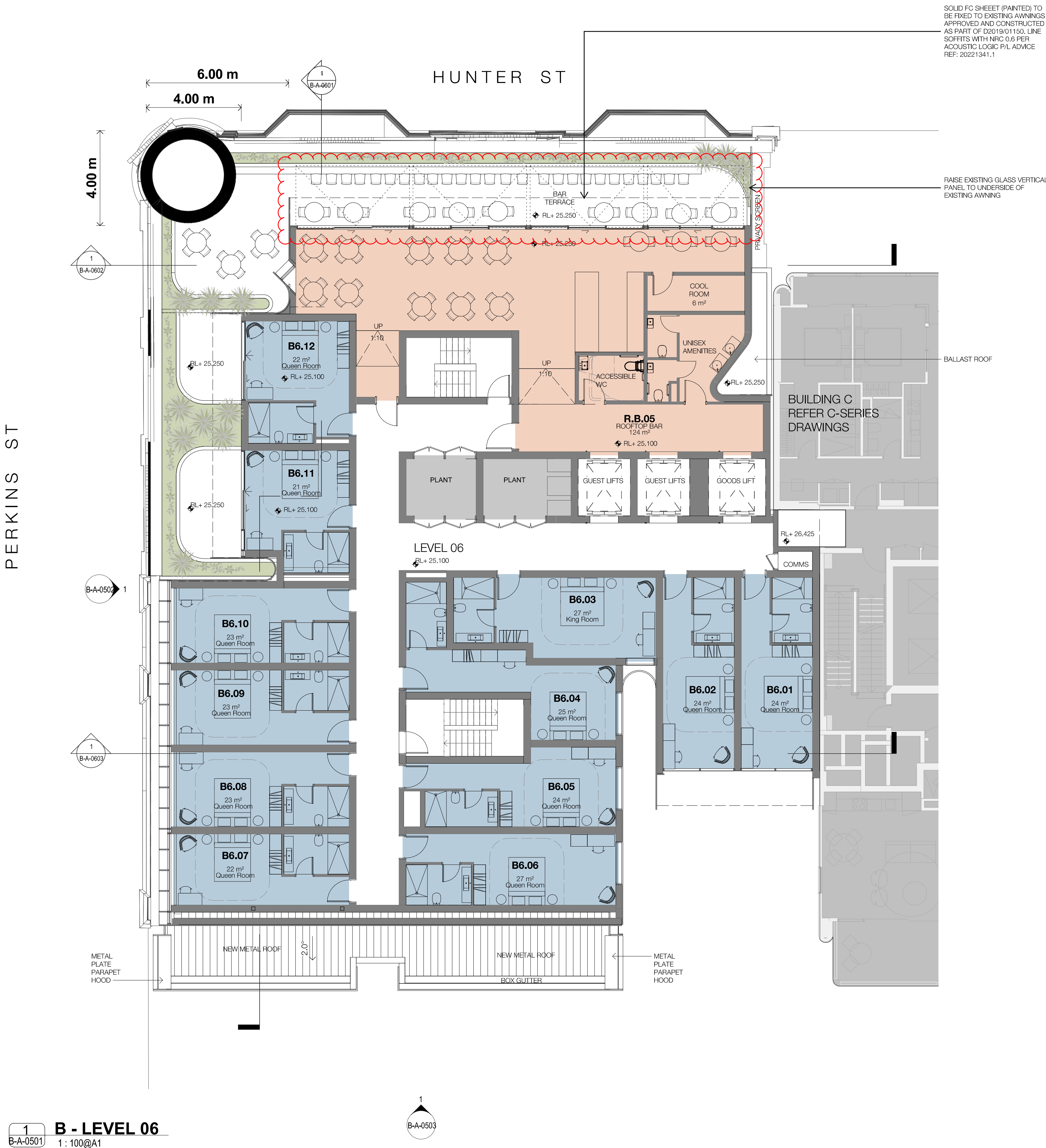
B - LEVEL 06 1 : 100@A1